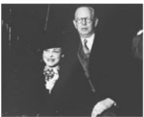
Jesse Livermore "The Boy Plunger" of Wall Street and his wife of twenty months set sail to Europe on the S.S. Rex after his 1934 bankruptcy. Before boarding Livermore said, "I hope to relieve my mind of some of my troubles."