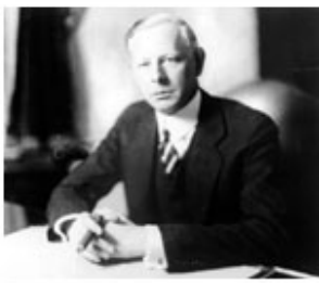
Jesse Livermore, the legendary "Boy Plunger" and "Great Bear of Wall Street" in his office in 1929 just after the "Crash"—when he went short the market and made over 100 million dollars. His powers were at their highest. His life slid downhill from here—ten years later he would kill himself.