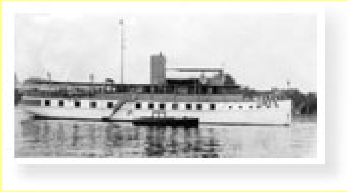
The original Anita Venetian with a 40-foot launch tied along side. Livermore loved yachting. In all there were 3 Anita Venetians —the last one was 300-foot long.