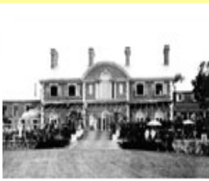
Livermore's mansion "Evermore" at King's Point Long Island. The dining room table sat 46 for dinner. There was a barbershop in the basement with a live-in barber. His 300-foot yacht was anchored in the back yard. The mansion was the scene of many grand parties—finally auctioned off—June 27th, 1933.